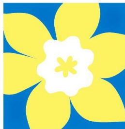
Canadian Cancer Society